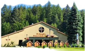
ST. JOSEPH'S PARISH - SQUAMISH